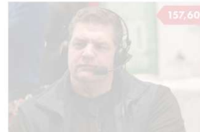
The end of an ESPN era